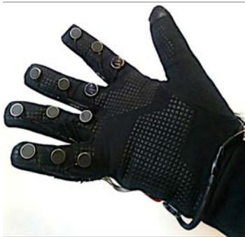
Figure 2: Feel Glove transmitting the flex actions using vibrotactile sensors

communication critical for maintaining their relationship [1,7]. Often at the core of such routines is video communication technologies [7,8]. While beneficial, the challenge is that communication is still limited to textual, verbal or visual mediums. This can lead to an absence of a partner's physical presence and means that long distance partners cannot experience affective touch from one another [11]. Currently, there are no affective means to send a remote touch. This is a problem as touch can strongly affect a couple's feelings of intimacy and connectedness [11].