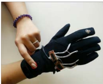
Figure 4: User pressing the soft-switch on one of the gloves.

Flex-N-Feel was designed with mobility in mind so that couples could stay connected throughout their day; it is flexible such that couples can appropriate it in a way that makes sense for their relationship; and, it offers subtle and private interactions so that touches can be discreet, if desired. Certainly, not all acts of touch are possible with the gloves. For example, it would be very difficult to give a full back massage to a remote partner given the reach of one's hands. Instead, the design is flexible within reason where a person could perform a large range of touch actions for their partner, rather than all types of touch. While we intended the gloves to support private interactions, it is possible that the