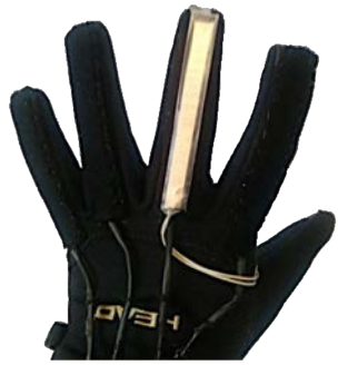
Figure 1: Flex Glove capturing the flex action of the fingers.