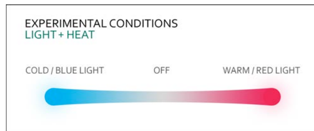
figure 2. The experimental conditions.

Two tangible interface designs are used. The first uses light information to provide feedforward. Light is continuous: two differently colored LEDs move gradually between off and on states such that when one is dimmed, the other is brightened (see figure 2). The second uses continuous heat information modulated by a heat circuit. The circuit is comprised of a metal coil, transistors, resistors, a heat sink and a battery. In effect, the battery is short-circuited to produce bursts of heat. The voltage is capped to keep the heat within a safe range. The temperature differential in the current prototype moves between room temperature (off) and warm; it does not yet account for cool temperatures. Further, while informal testing showed that a change in temperature is detectable, the rate of change is slow, particularly in comparison to the rate of change possible for light. We are reviewing solutions to these problems; possibilities include pre-heated or cooled blocks, or warm and cool air piped into the tangibles.