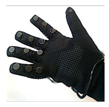
Figure 2: Feel Glove transmitting the flex actions using vibrotactile sensors

communication critical for maintaining their relationship [1,7]. Often at the core of such routines is video communication technologies [7,8]. While beneficial, the challenge is that communication is still limited to textual, verbal or visual mediums. This can lead to an absence of a partner's physical presence and means that long distance partners cannot experience affective touch from one another [11]. Currently, there are no affective means to send a remote touch. This is a problem as touch can strongly affect a couple's feelings of intimacy and connectedness [11].