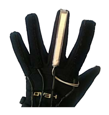
Figure 1: Flex Glove capturing the flex action of the fingers.