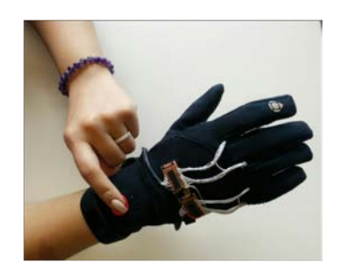
Figure 4: User pressing the soft-switch on one of the gloves.