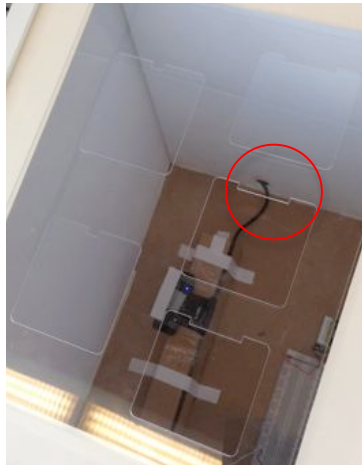
Figure 7. A transparent acrylic frame with constraints

interactive table contains a camera vision system implemented with a reactIVision engine. Each tangible letter or letter card is identified by the reactIVision engine, which passes identification and location information to a custom application written in Processing.