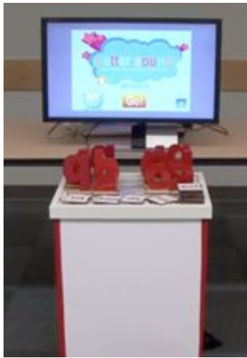
Figure 1. Tactile Letters: a TUI with a display and a set of tangible letters with or without texture cues.