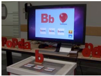
Figure 3. In level 1, a child placed a tangible letter “b” and three letter cards on the interactive table. Digital images and sounds were triggered.