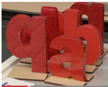
Figure 2. Tangible letters with texture cues.