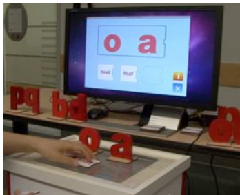
Figure 4. In level 2, a child placed two tangible letters “oa” on the interactive table. Because “oa” were irregular, the system triggered the visual-audio feedback to indicate they are grouped.

demonstrated that multisensory training has great potential to induce strong reading improvements in dyslexic children [11,16].