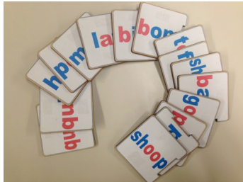
Figure 5. Twenty-four pieces of letter cards